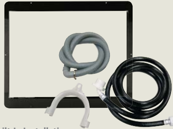
Built-In Installation DWVTKBL Trim Kit * DWVBIHK Built-In Hose Kit