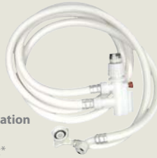
Countertop Installation DWVCTHK Countertop Hose Kit*

Built-In Installations VESTA™ Built-In Trim Kit (DWVTKBL) This reflective black trim kit adds a clean, polished look to your built-in VESTA dishwasher installation. VESTA™ Built-In Hose Kit (DWVBIHK) Connect your built-in VESTA dishwasher directly to hot and cold water valves with this hose kit.